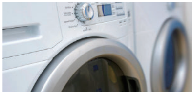
Quality Assurance Test