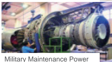
Military Maintenance Power