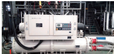
Burn-In, Aging Test