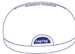
LTI HID Not Included