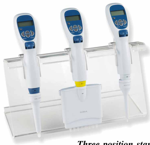
Three position stand