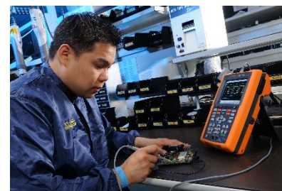
Figure 1. Indoor viewing mode