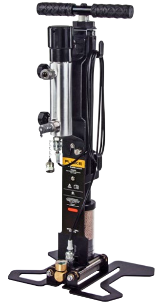
Figure 1. The Fluke Calibration 700HPPK Pneumatic Test Pump

Gas custody transfer flow computers that calculate flow by measuring the differential pressure across a flow restriction, such as an orifice plate or other differential pressure flow device, require special calibration to perform at optimum accuracy. In custody transfer applications where the buying and selling of commodities like natural gas is involved, calibration checks are performed frequently as a matter of fiduciary responsibility. For the purpose of this application note, the use of gas custody transfer flow computers in the natural gas transmission industry is referenced. Flow computers need multiple measurements to calibrate each device. In the normal application, three measurements are made: volumetric flow, static (line) pressure and temperature. A calculation is performed using this data to determine the actual mass of the gas flowing through the pipeline.