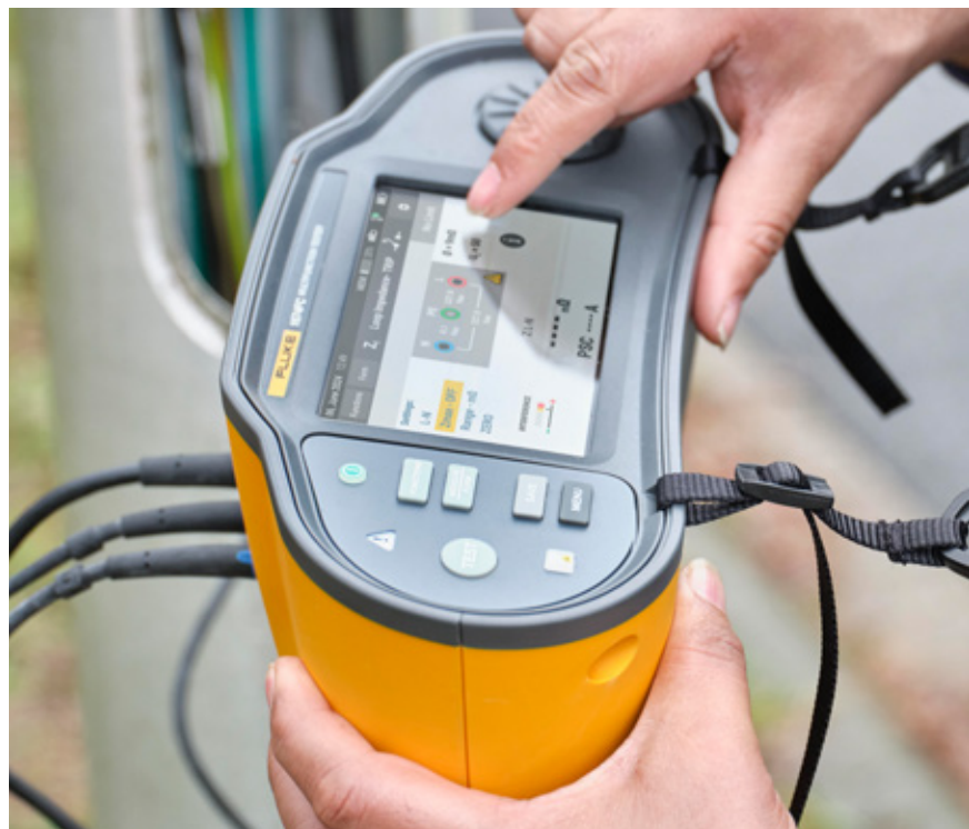
Full-color touch screen and tactile rotary knob for fast navigation

Simplify report generation with automatic report population, Fluke Connect integration, and one-touch reporting with Fluke TruTest™ software.