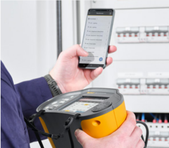
Reduce manual data entry and recordkeeping