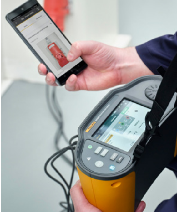
Assign photos directly to specific test points for more detailed documentation