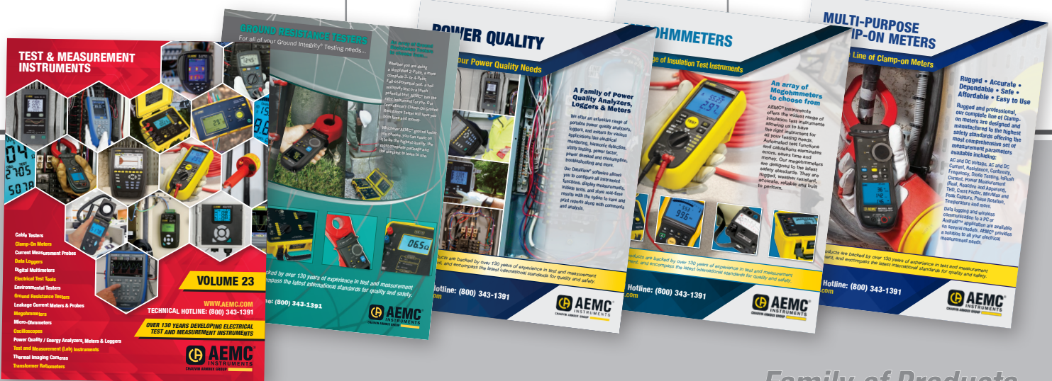
Family of Products

Chauvin Arnoux ® 12-16 Rue Sarah Bernhardt 92600 Asnières-Sur-Seine, FR Tel +1 33 1 44 85 45 85 Fax +1 33 1 46 27 73 89 info@chauvin-arnoux.com www.chauvin-arnoux.com