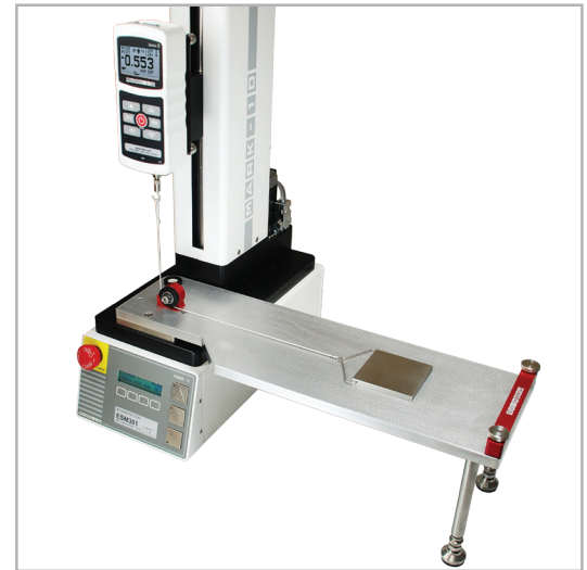
Shown with an ESM301 test stand and G1086 COF fixture

The M5-2-COF may also be used for a number of common tension and compression testing applications. The gauge is based on Mark-10's Series 5 advanced digital force gauges, and includes the series' full set of functions and settings.