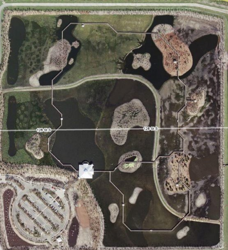
The Green Cay Wetlands recycle about two to three million gallons of water daily.