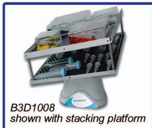
B3D1008 shown with stacking platform

Modeled after our popular BioMixer series of “nutating” shakers, these platform rockers provide the perfect 3-dimensional motion for all blot related applications. Their tilt angle and speed have been optimally set for gentle, but thorough mixing in gel trays, boxes and other flat vessels.