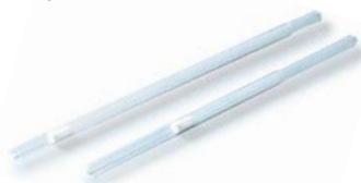
Telescoping filling tube