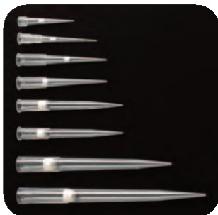
Low Retention, Filter Pipette Tips