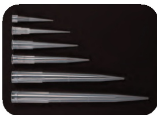
Low Retention Pipette Tips